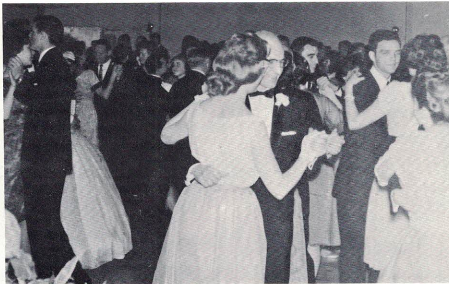
DANCE! DANCE! DANCE!

Professional class, new reader eye appeal, and the opportunity to number the pages as most magazines do (not counting the covers) are just a few of the features afforded by the new cover to this, the world's most vital magazine!