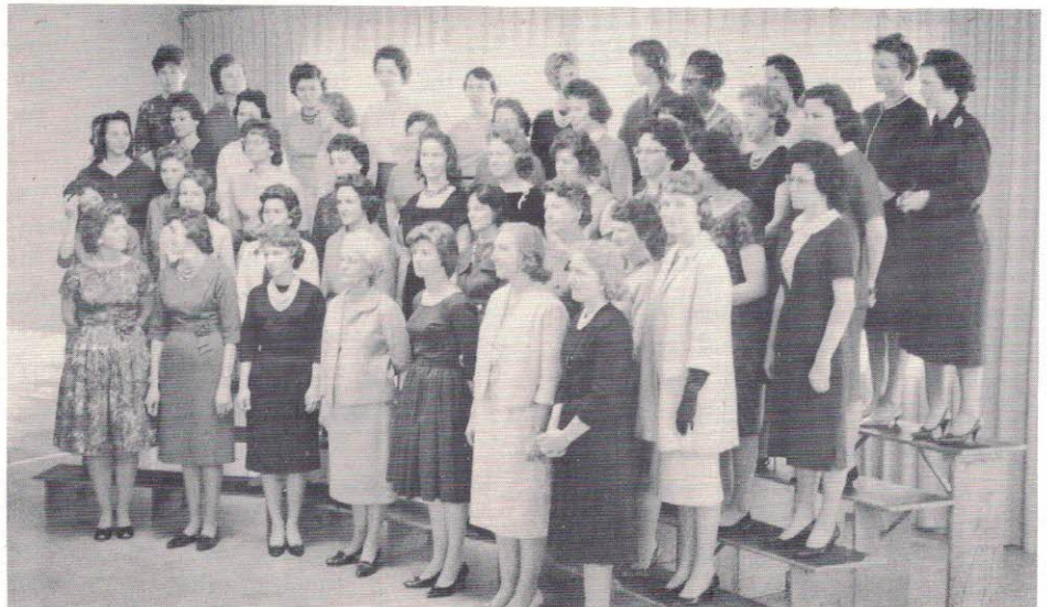
"Our wives make up fifty percent of our ministry." (HWA)

The ministers' wives sat in on one session covering a thorough discussion of the new truth recently revealed concerning Simon Magus. There were other special meetings for the wives to exhort and encourage them in their duties and responsibilities.