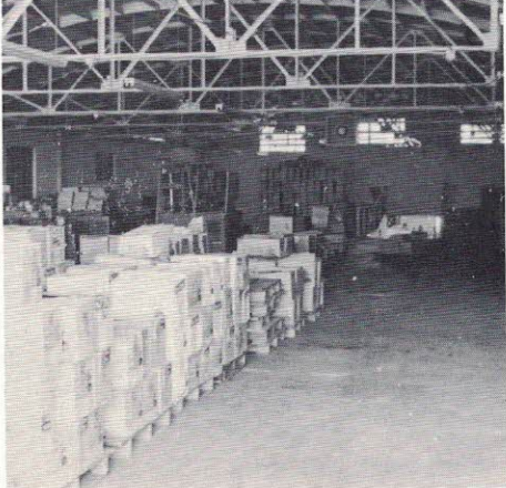
Space seems to suddenly vanish.

"Leaving Sydney, and a waving (Continued on Page 5)