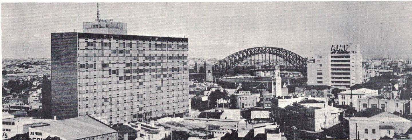
Our Australian offices are housed in one of the finest buildings in Sydney—The MCL Building.