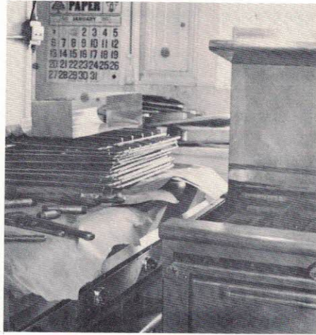
Campus kitchen changes ranges.