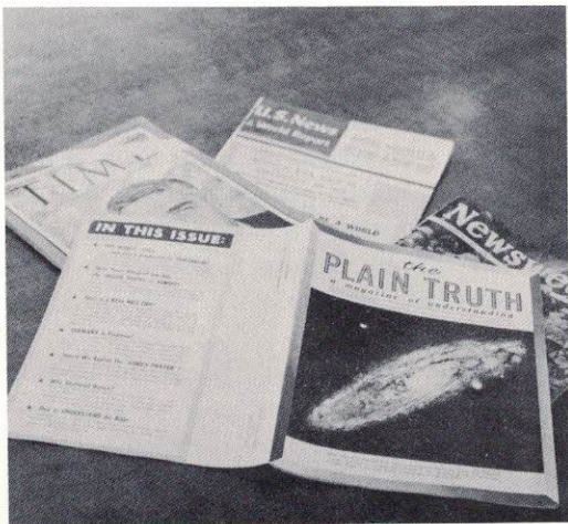
Quality cover matches magazines.